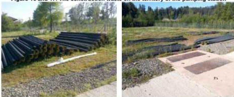
Figure 16 and 17: The construction waste on the territory of the pumping station