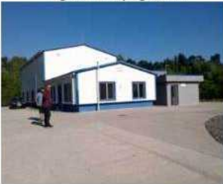
Figure 8: Pumping station