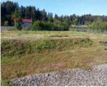
Figure 4: Territory of the pumping station