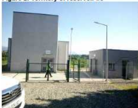
Figure 2: Territory of reservoir #3