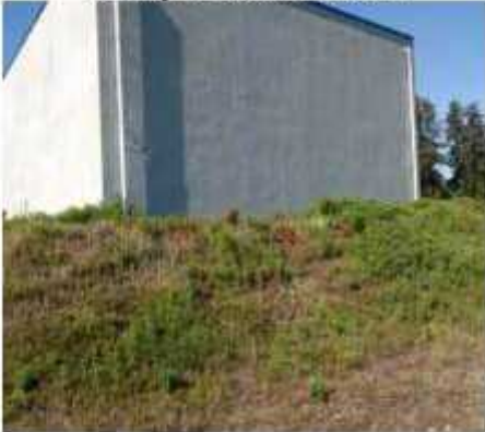
Figure 10: Self-restored grass – the territory of the first reservoir