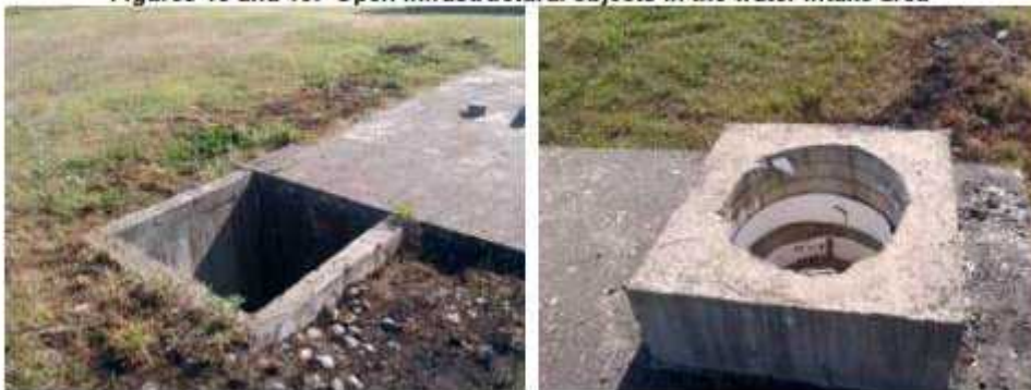
Figures 18 and 19: Open infrastructural objects in the water intake area