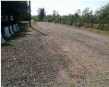
Figure 12: Access road to the first reservoir