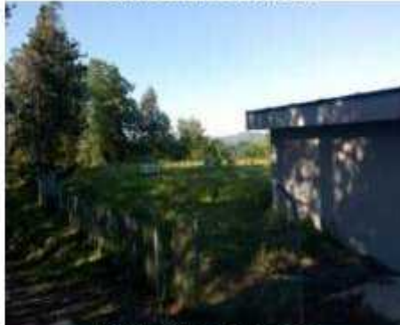
Figure 7: Reservoir #1