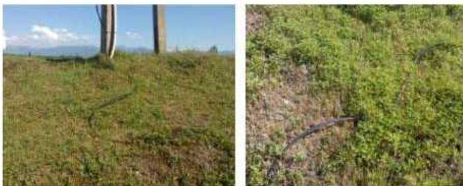
Figures 20 and 21: The wire cable on the earth surface