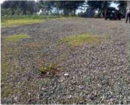
Figure 6: Reservoir #3