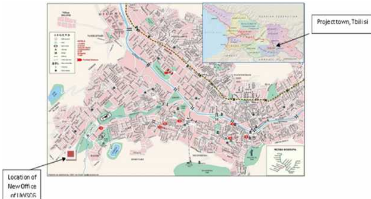
Fig.1 Location of Head Office and Map of Project Town

Image No1 below represents the building of the UWSCG's Head Office in Tbilisi after the completion of the TBI-01 project.