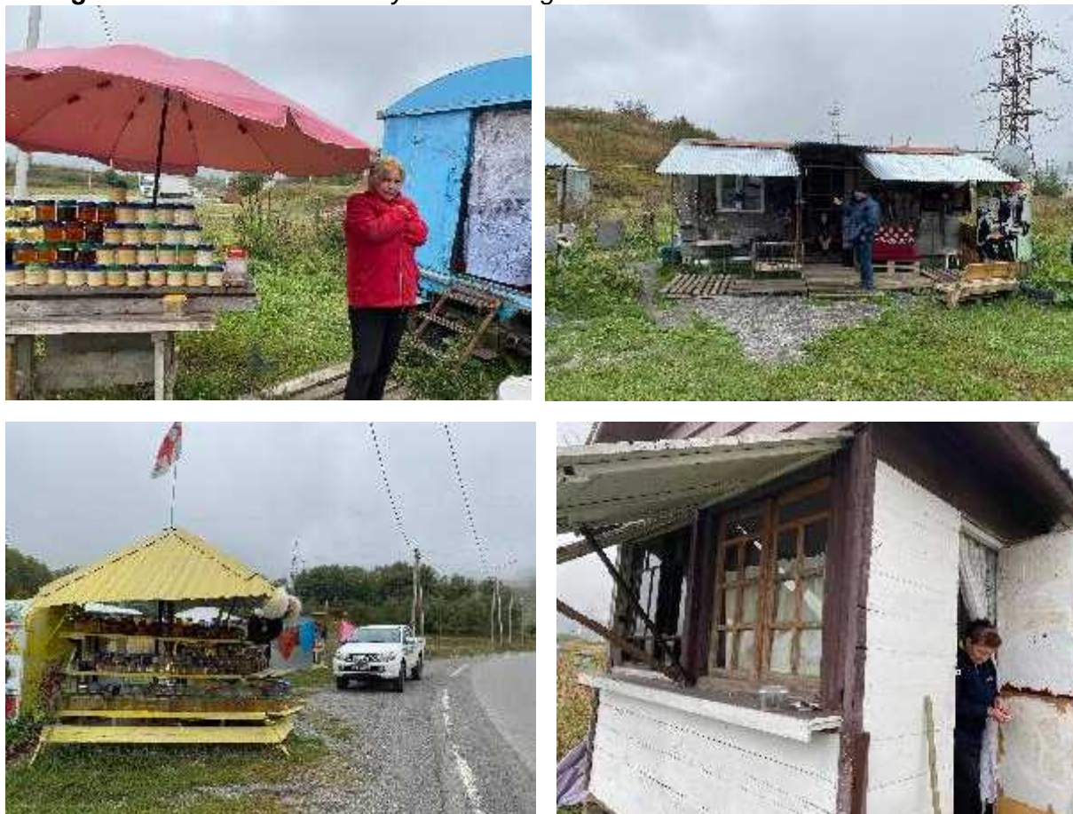
Figure 6: Photos of the one by one meeting with business owners

51. During the individual meetings, questions were asked about the allocation of additional connection for businesses that plan to expand in the future. PA specialist gave information about procedures of requiring for additional connection. Main question asked during the meeting, was about terms of finishing of the project. According to local honey producers, having proper sanitation system can affect and will improve the quality of local Honey.