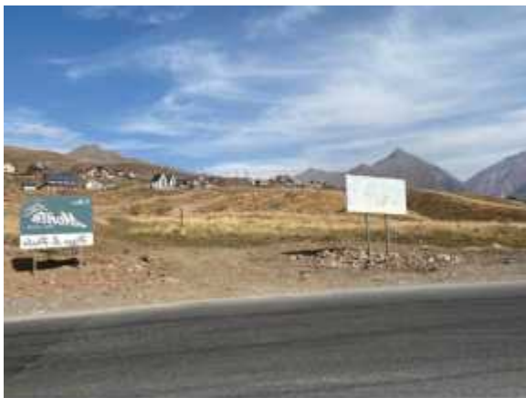
Figure 2: Photos of the Reinstated AD Banners