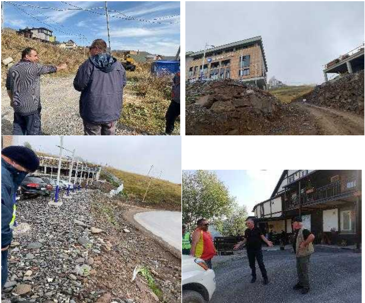
Figure 4: Photos of the Meetings with quarantine service Hotels