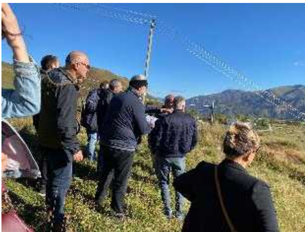
Figure 8: Photos of the Site Visit 08.10.2020

58. The group visited all the areas, where differences in existing terrain and levels made it difficult connection to the sewerage network. In consultation with the builders, alternative opportunities were identified, in accordance with the interests of the local population.