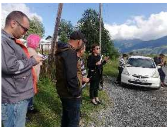
Figure 5: Photos of the public consultation meeting