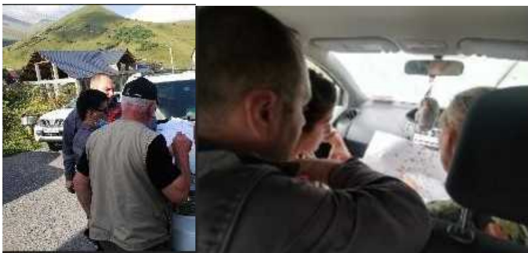
Figure 3: Photos of one by one Meetings with the local population