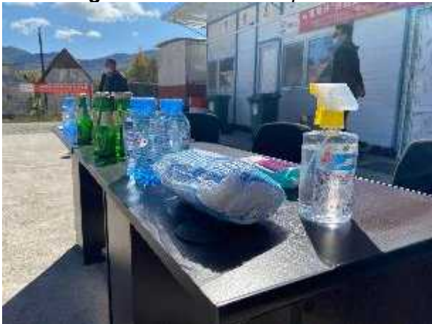
Figure 7: Photos of the public consultation meeting