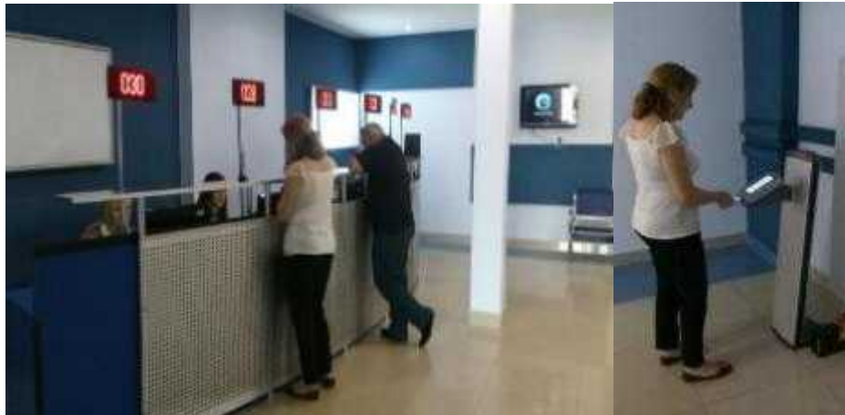
Figure 3: AP gets queue registration number at Local Service center (on the example of Kutaisi Service Center)

22. It should be mentioned also that complaints log is available at each construction site and any affective person may fill the complaint log and submit to the contractor directly.