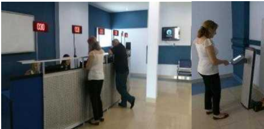
Figure 3: AP gets queue registration number at Local Service center (on the example of Kutaisi Service Center)

23. It should be mentioned also that complaints log is available at each construction site and any affective person may fill the complaint log (please see Annex 1) and submit to the contractor directly.