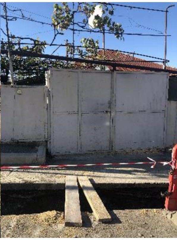
1 October 2018. Kate Chomakhidze, ES of USIP