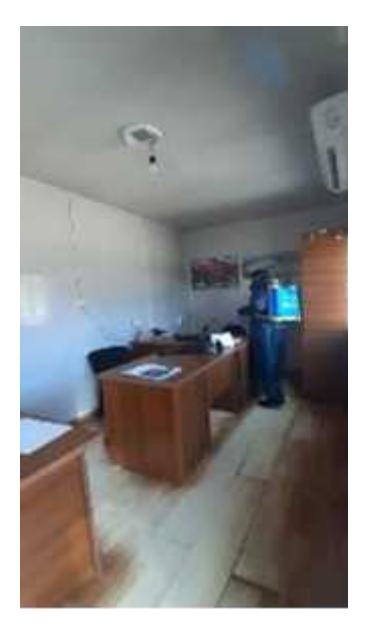
Abasha office – Prevention means against COVID-19 virus; disinfection procedures, Photo-04