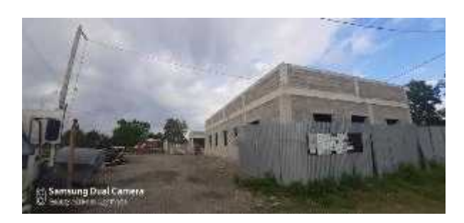
Abasha - UWSCG's Service Center area, construction getting towards the end; front view, Photo-06