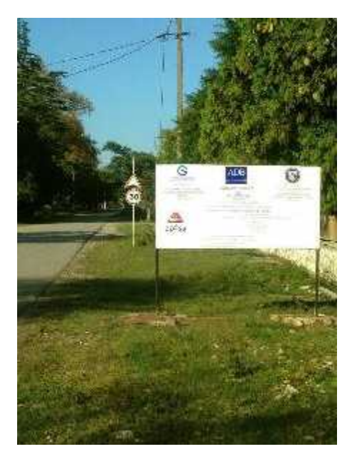
Abasha - City Distribution Network, Photo-02