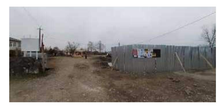
Abasha - UWSCG's Service Center area during construction; front view, Photo-01