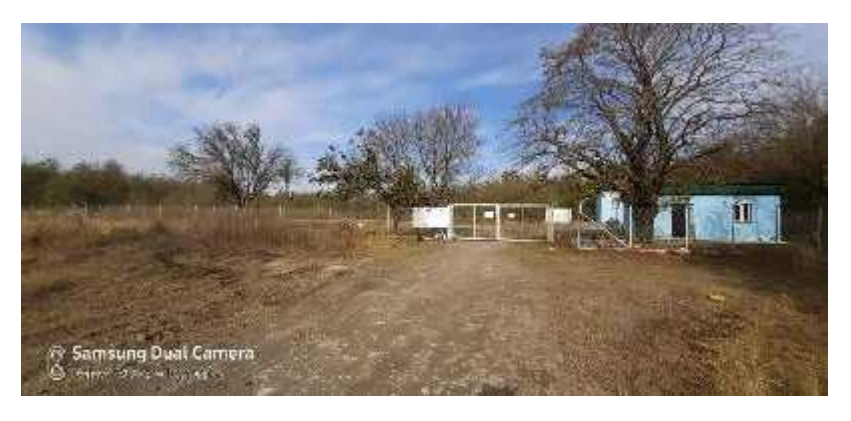
Abasha – Headwork, Rehabilitation of existing buildings for Well Field, Photo-03