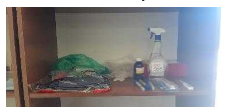
Abasha office – Prevention means against COVID-19 virus, Photo-05