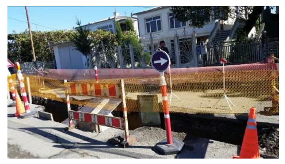
Photos of Zug-02 project - Rehabilitation of Sewerage Network in Zugdidi